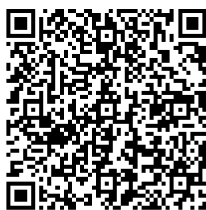
Salford Neurodevelopmental Support Survey

The survey you will prompt you to provide an email address for us to contact you if would like to be kept updated of any developments made on the support offer. We want to make the system work for you.