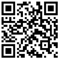
I Am Autism

I Am Autism: Home - I AM (i-am-autism.org.uk)