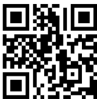
Salford Parent Carer Forum

Salford Parent Carer Forum: Offer a range of groups and drop-ins for parent carers. You can access their website https://salfordpcf.com/